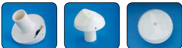
For External Halyard Poles • Slip Fit Type • Stationary • Single Pulley