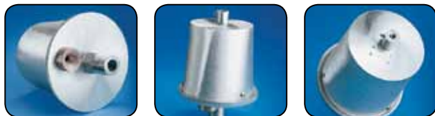
For Internal Halyard Poles • Threaded Type • Revolving • Single Pulley