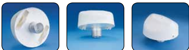
For External Halyard Poles • Threaded Type • Stationary • Double Pulley