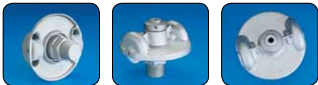
For External Halyard Poles • Threaded Type • Revolving • Double Pulley