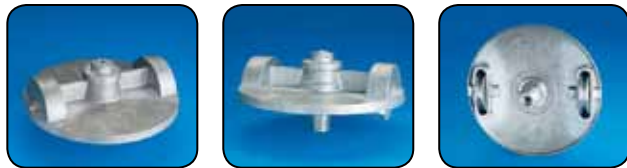
For External Halyard Poles • Threaded Type • Revolving • Double Pulley