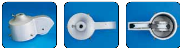
For Internal Halyard Poles • Cap Style • Stationary • Single Pulley