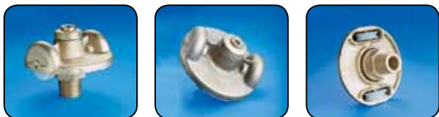
For External Halyard Poles • Threaded Type • Revolving • Double Pulley