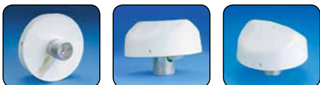
For Internal Halyard Poles • Threaded Type • Stationary • Single Pulley